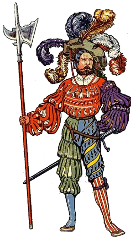
Do not make fun of this man. He is a typical German mercenary soldier. They were famous for their flamboyant dress, a style known as "Puff and Slash". They were also noted for their rough treatment of civilian populations. The English government hired many hundreds of such soldiers to fight against the Scots and crush the rebellions of 1549.