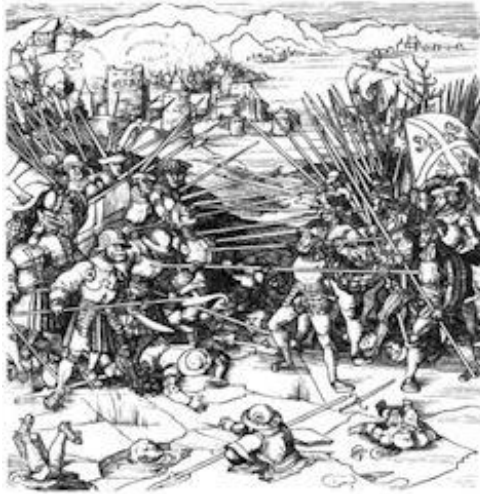
A contemporary woodcut showing what the mercenary soldiers used by Dudley may have looked like.