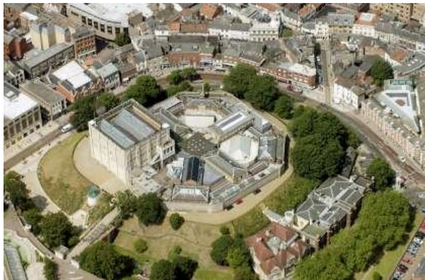
Norwich castle surrounded by the modern city of Norwich.

Robert Kett was imprisoned and later hanged from the battlements of Norwich Castle .