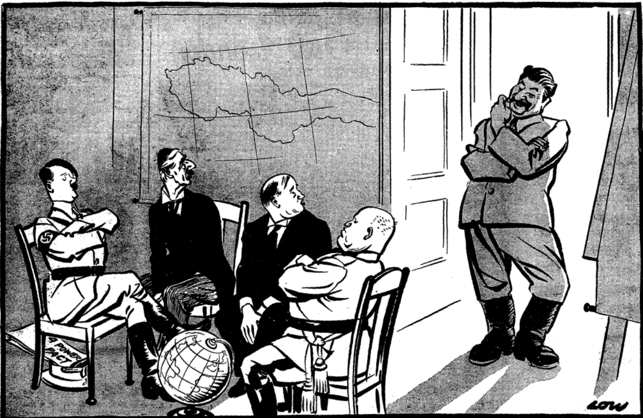
WHAT, NO CHAIR FOR ME ?

A cartoon published in a British newspaper, 30 September 1938. It is commenting on a meeting in Munich of Hitler, Chamberlain, Daladier and Mussolini. Stalin is shown in the doorway.