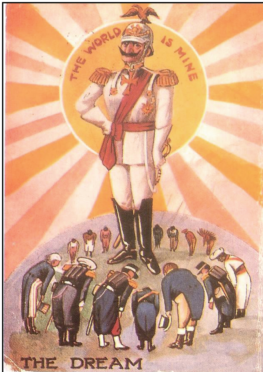
A postcard published in Britain in 1915. The central figure is the Kaiser. The other figures represent various countries.