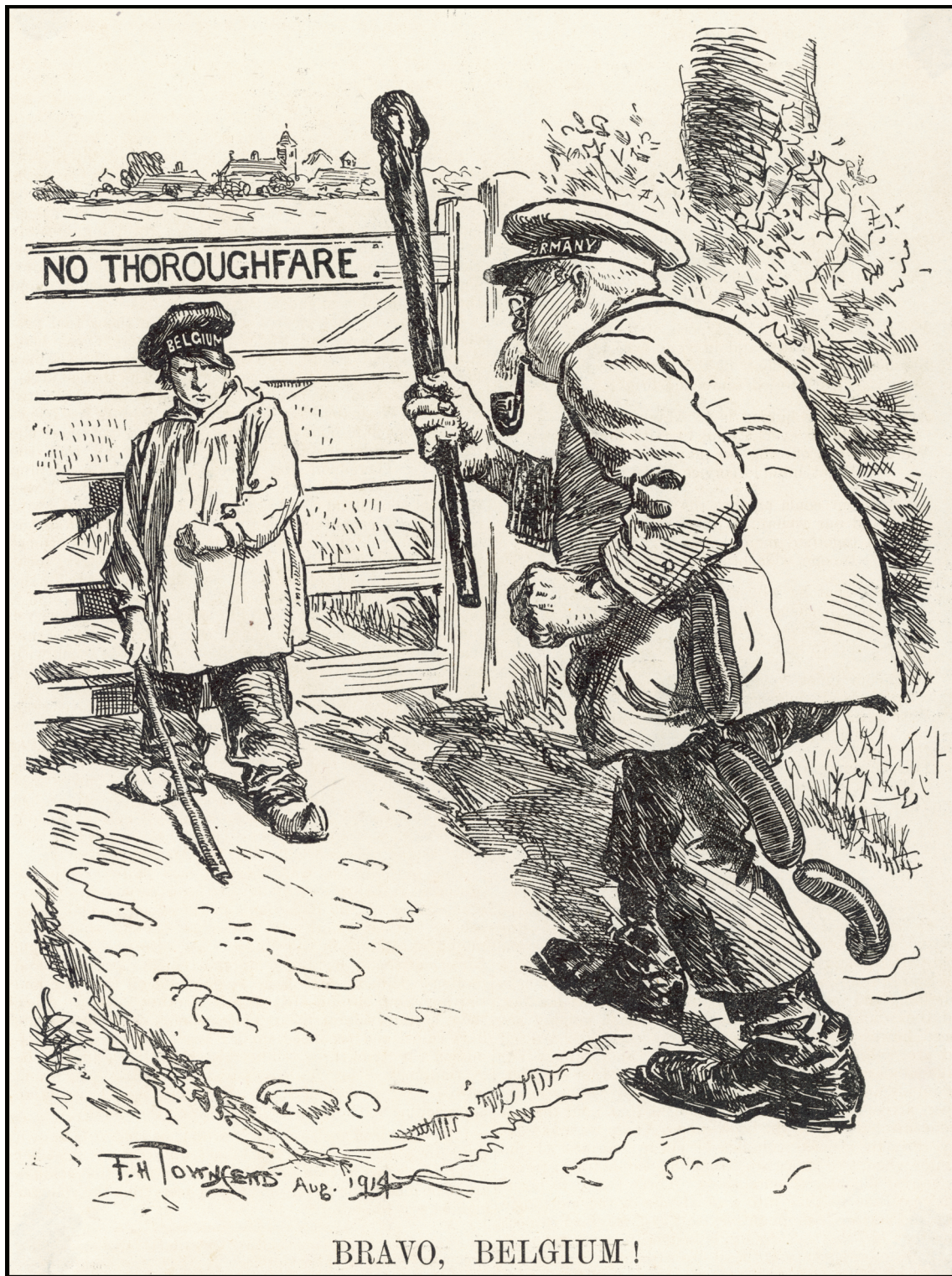
A British cartoon published in August 1914.