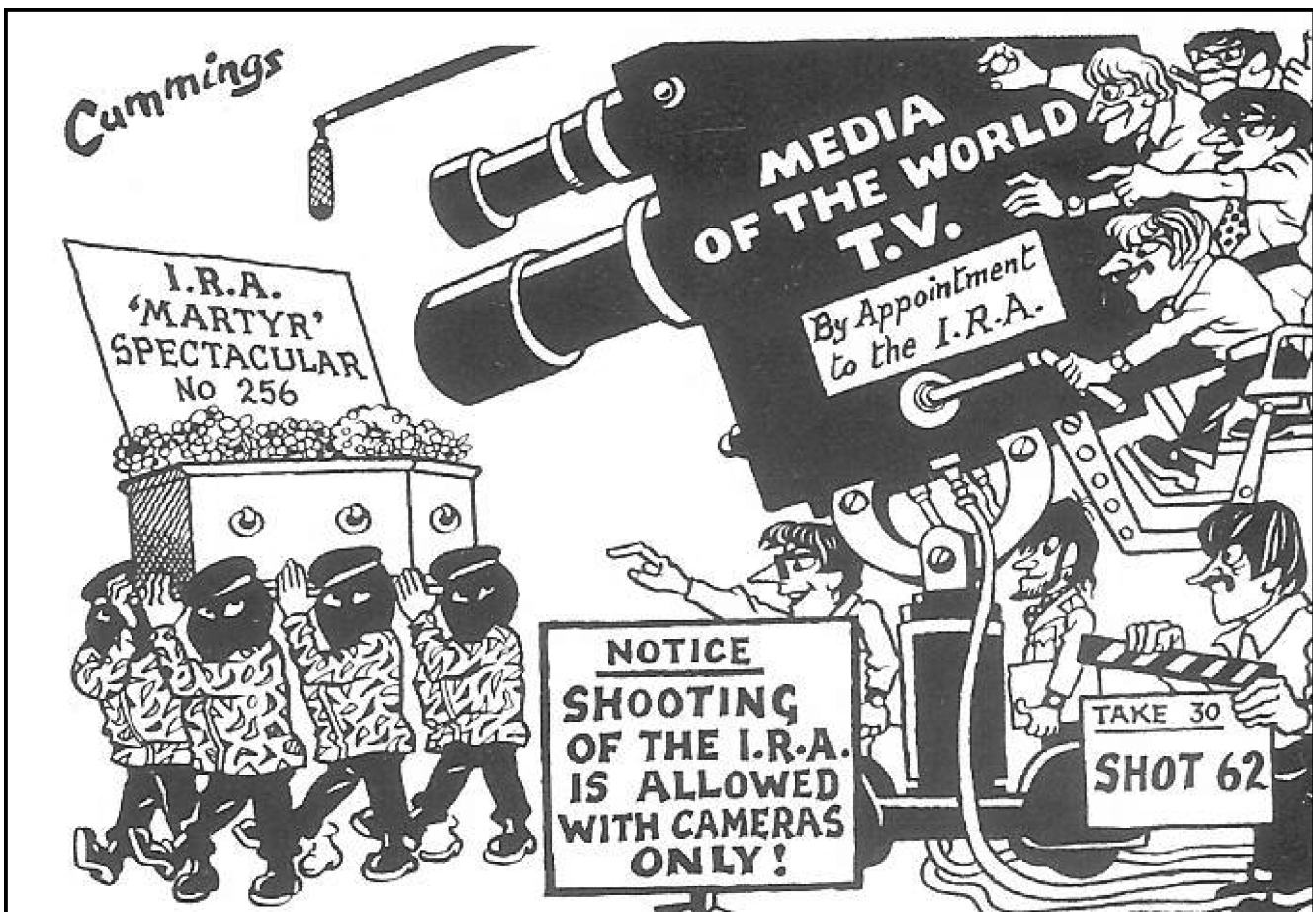
A cartoon published in an English newspaper, 17 May 1981. It is commenting on the IRA hunger strike.