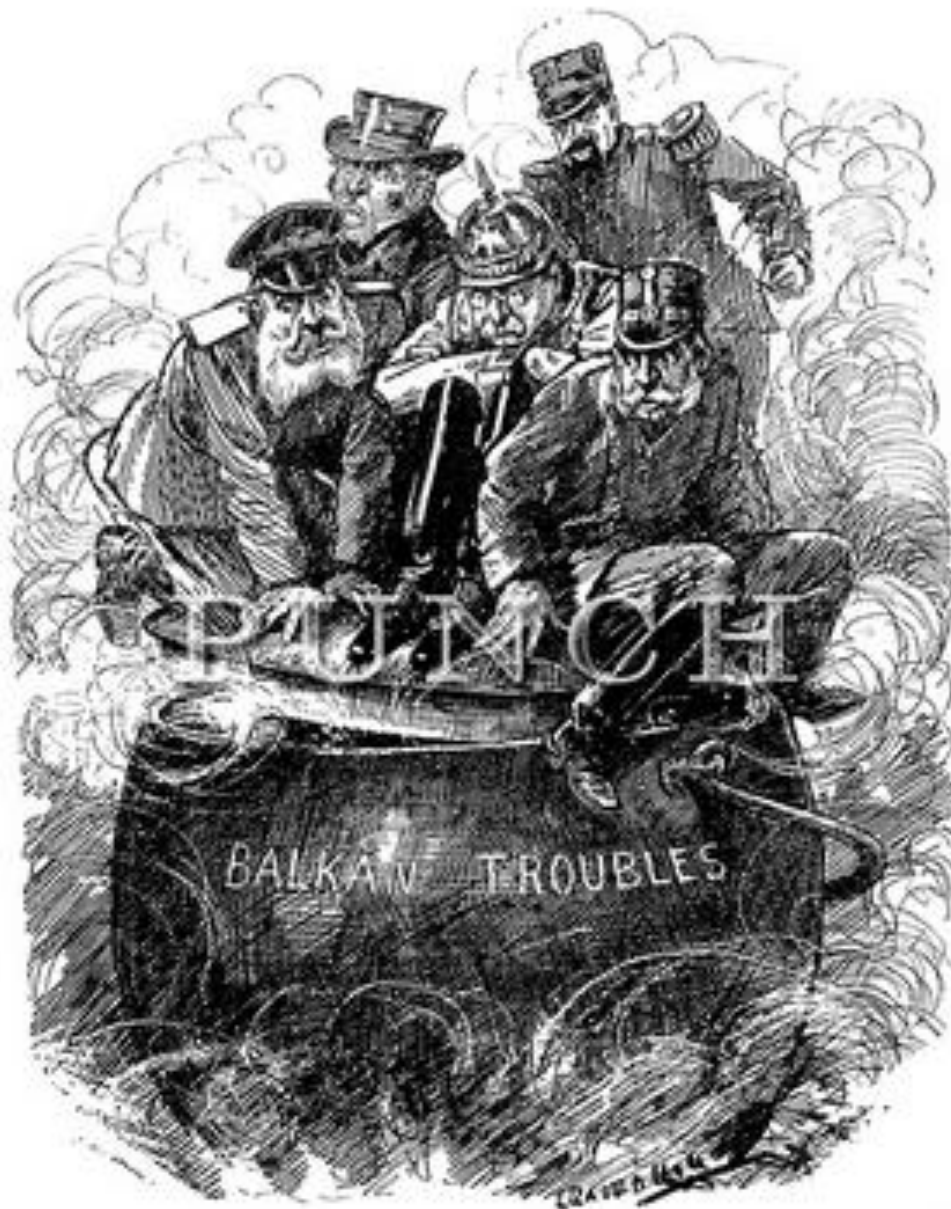
THE BOILING POINT.